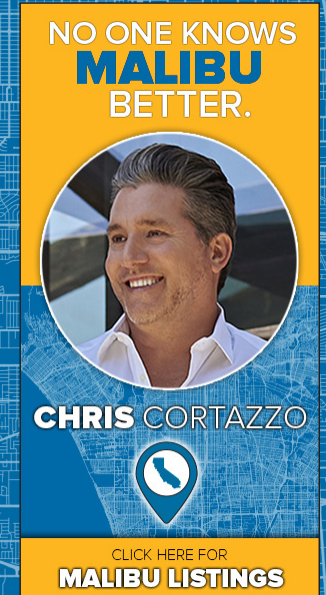
Promoted on website